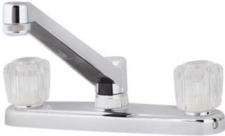
Twin Handle Kitchen Faucet Chrome-Plated Finish 1/2" MIP Connections Less Side Spray